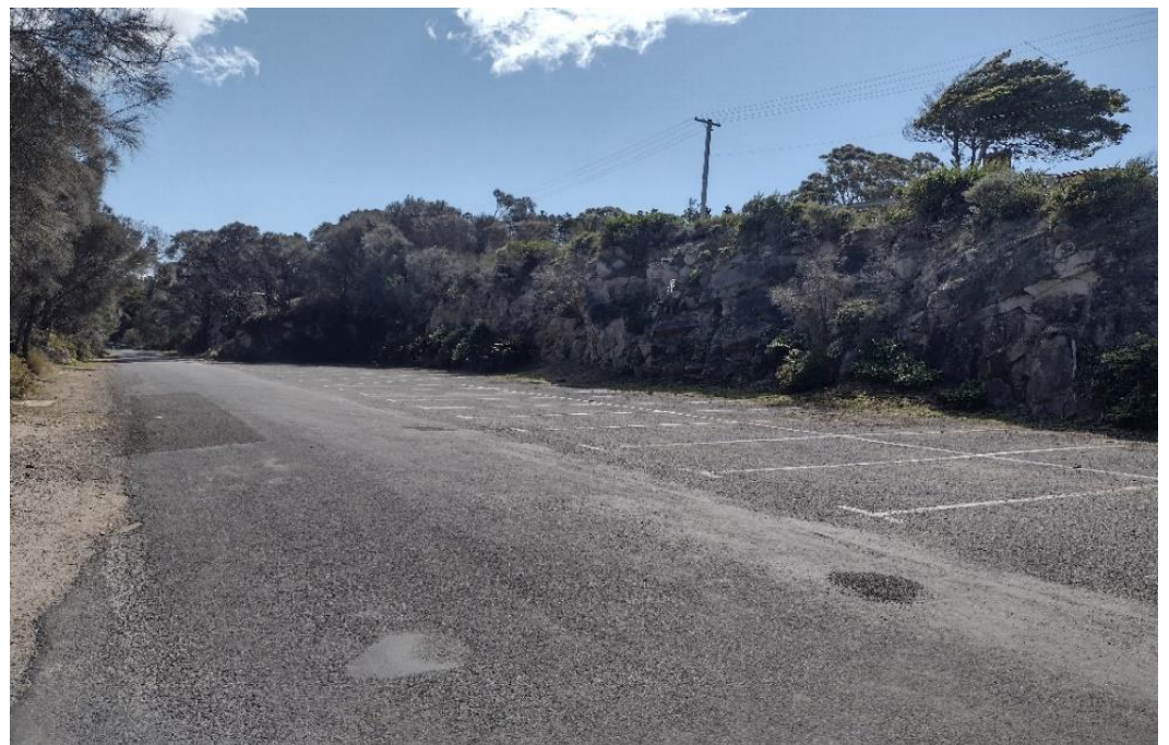
Coles Bay jetty car park