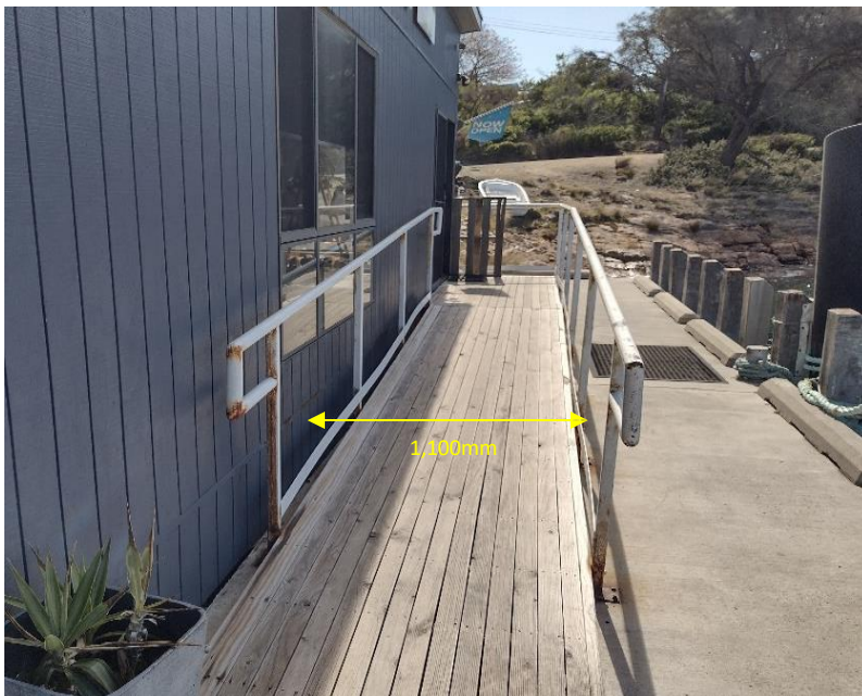
Access to the office