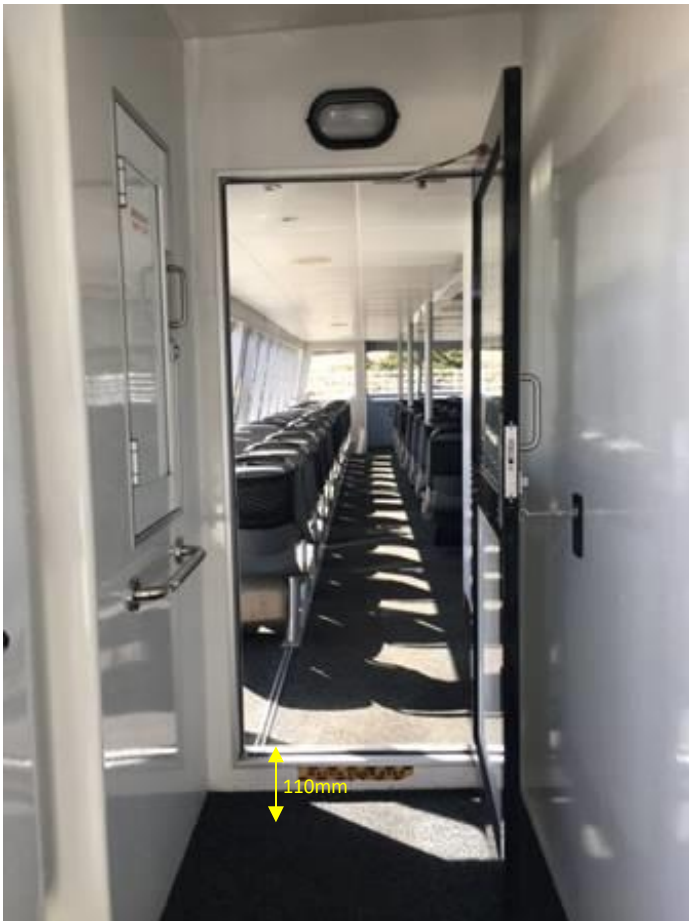
Entry to Vista Lounge (this is wheelchair accessible)