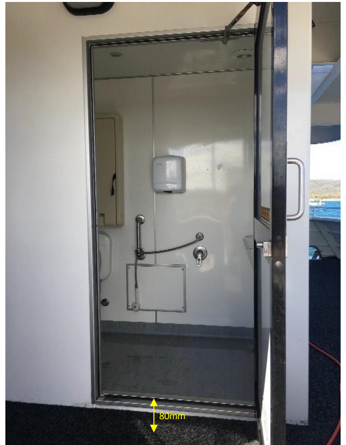
Accessible bathroom for Vista Lounge guests